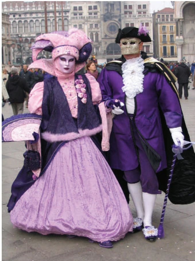
Venezia—Carnevale (celebrated this week)

If you have any questions, please call (206) 320-9159 and leave a message.